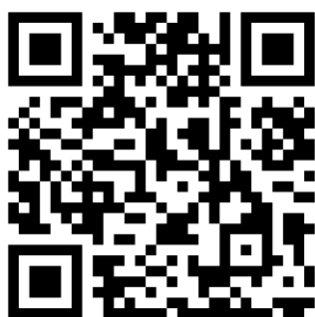
Map for the social dinner